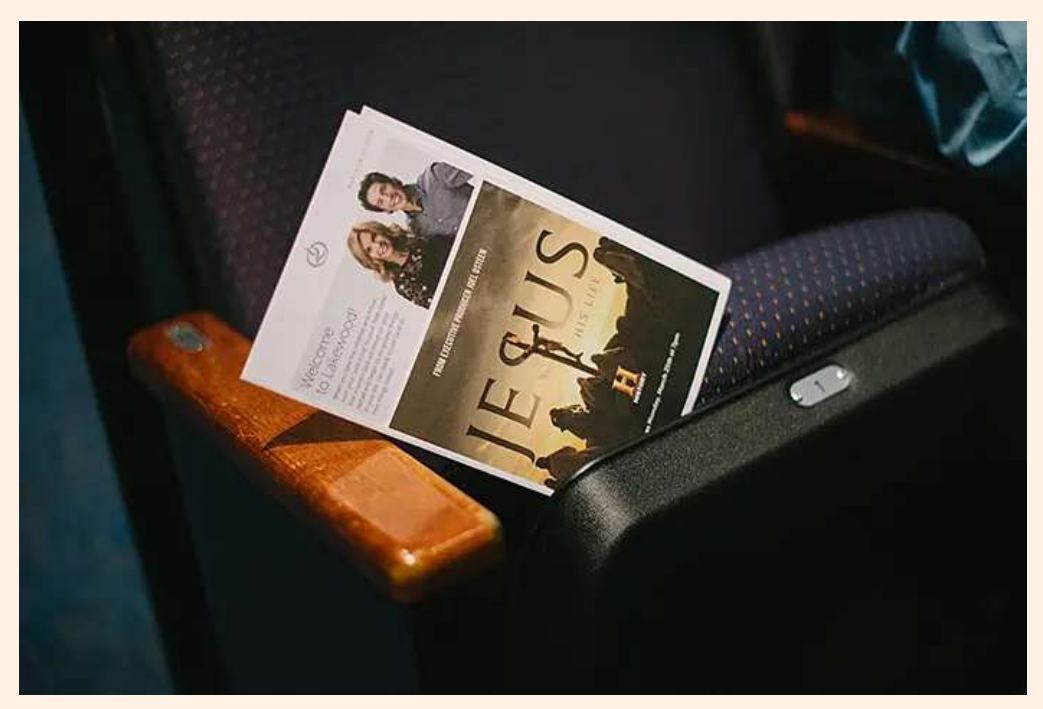
A pamphlet advertising a History Channel TV production about Jesus Christ that Joel Osteen is executive producing, left on a seat in the church

"Joel Osteen won't open his church that holds 16,000 to hurricane victims because it only provides shelter from taxes," wrote one person on Twitter. That tweet got more than 100,000 likes. Lakewood was shamed into opening its doors. It took in several hundred people until the biblical-scale flood receded. But it left an impression that Lakewood was more of a corporation than a church.